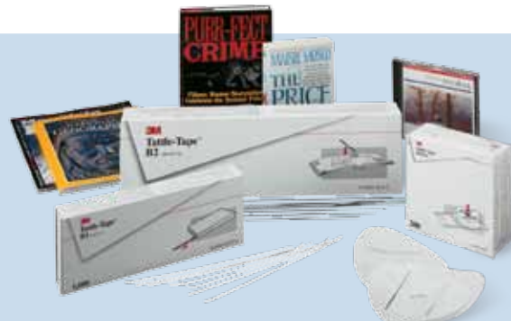
Tattle-Tape™ Strips and Applicators