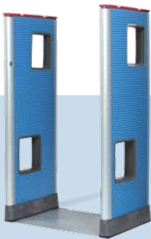
EM (Electro Magnetic) Detection

3M's security systems help libraries ensure that patrons won't be disappointed. Our affordable, ultra reliable technology helps protect your print materials and digital media—and your community's investment—from inadvertent removal and theft.