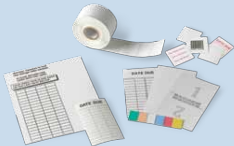
RF (Radio Frequency) Tags and Detuners

Without an effective security system in place, many libraries risk the problems associated with the temporary and permanent loss of materials. When items are unavailable, the patrons of your library must do without or go elsewhere. And, although the replacement cost may appear to be low, it is important to factor in the staff time to reorder, catalog and process these missing materials, which can double costs when taken into consideration.